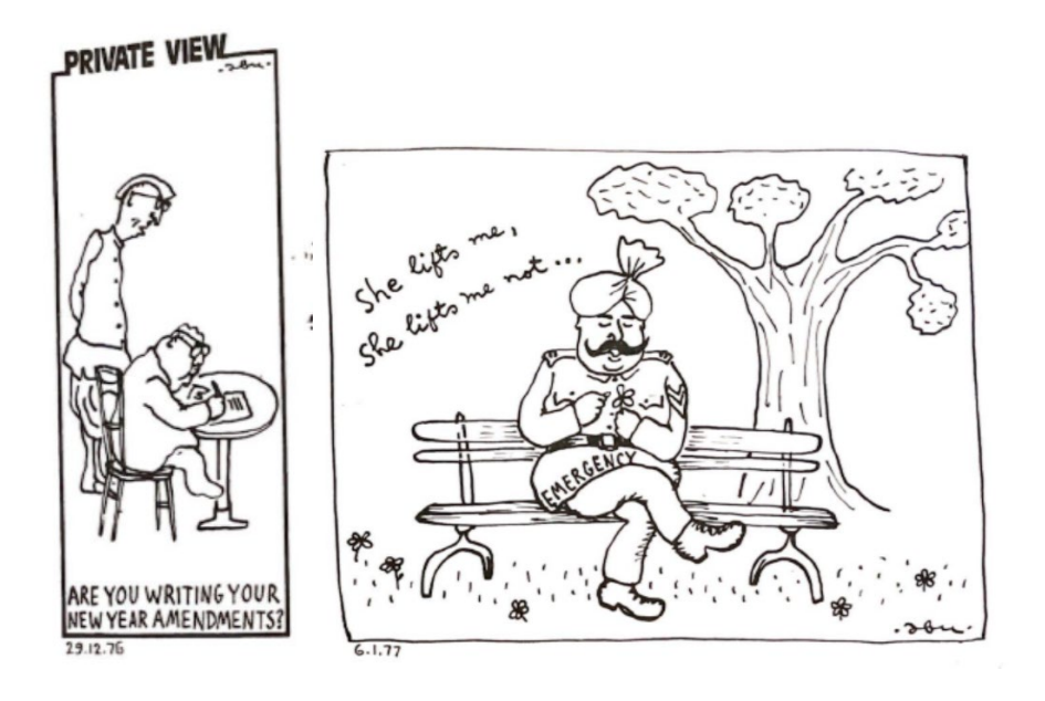
Figure 8 Figure 9

PM and subsequently used her influence in the party to pass hurried amendments in the Constitution. Some of these amendments made it virtually impossible for her to be prosecuted further in the cases against her, thus saving her post as PM. Such an aggressive assertion of (arguably) Constitutional powers on the part of the government hints only at an autocratic method of functioning in which amendments are forcibly made to the Constitution even as citizens' fundamental rights remain suspended. The subversive impact of the cartoon thus lies in revealing this autocratic equation between the government and citizens whom the government is meant to serve.